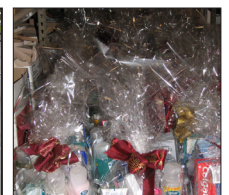
Ready for delivery.